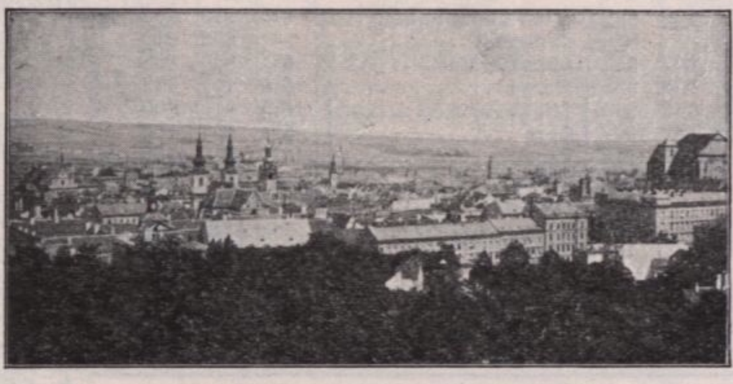
• TROPNAV •