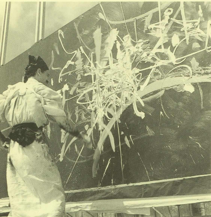
Georges Mathieu , öffentliche Malaktion, Japan, 1957