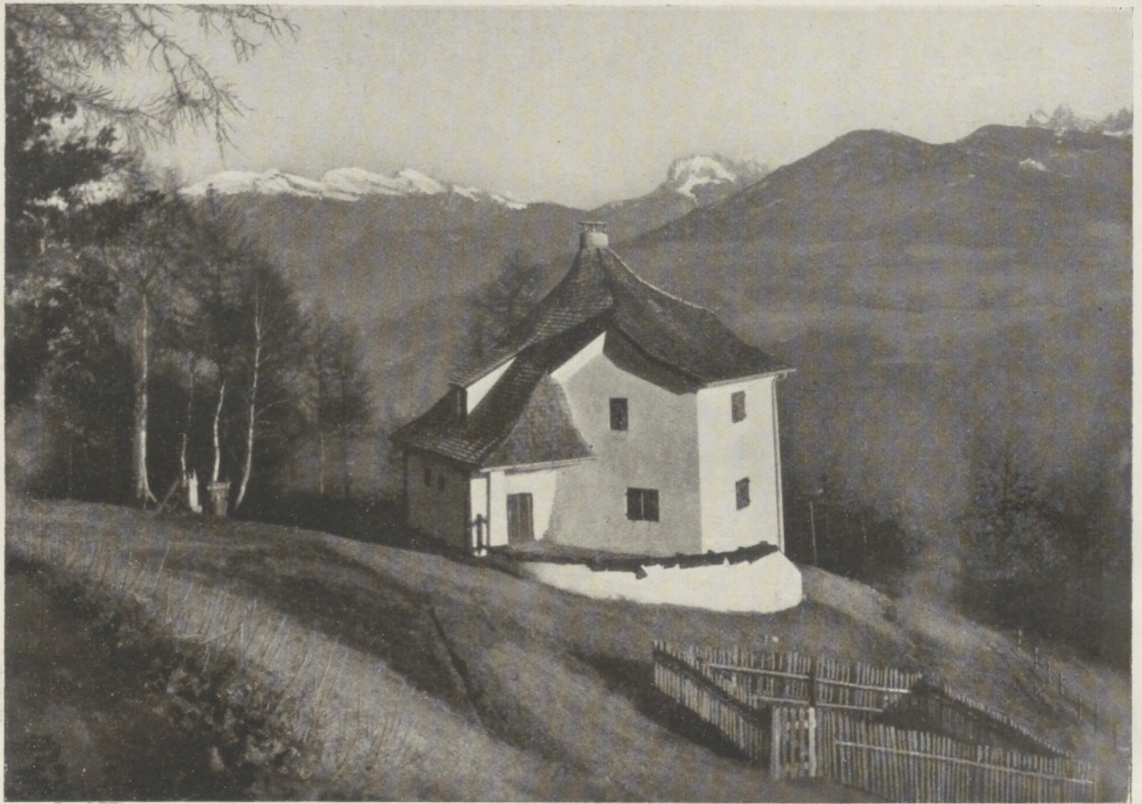
Landhaus Settari (1200 m Höhe), Eisacktal. (Ansicht Süd-West.)