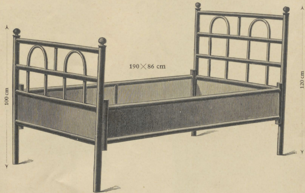
Nr. 9761 Nr. 9771

Angesetzte Maße zeigen die inneren Dimensionen der Betten — Les mesures indiquées sont les dimensions intérieures — Mentioned measures are the inside lines — Las medidas indicadas son las dimensiones interiores. — As medidas indicadas são as dimensões interiores — De genoeteerde maten duiden de afmetingen aan van den binnenkant der ledikanten