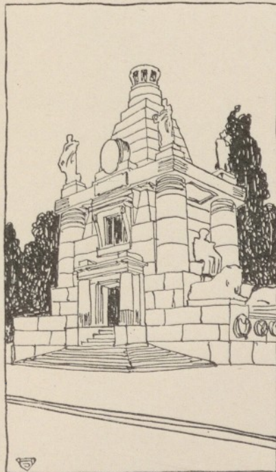
Von Professor Josef Hoffmann.