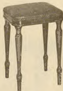
No. 907—SU9 SEAT 12\frac{1}{4} \times 12\frac{1}{4} IN.