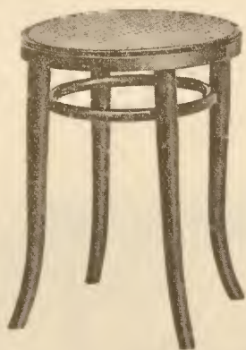
No. 900—S3. CANE SEAT No. 900—S4. VENEER SEAT HEIGHT 18 IN. SEAT 13\frac{1}{4} IN. DIAMETER