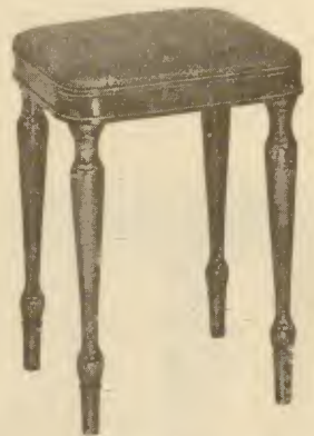
No. 907—SU9 SEAT 12¼ x 12¼ IN.