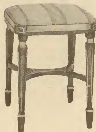
No. 4438—SU9 SEAT 14\frac{1}{2} \times 14\frac{1}{2} IN.