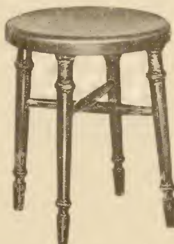
No. 908. CORK SEAT SEAT 13\frac{1}{4} IN. DIAMETER