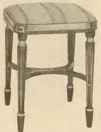
No. 4438—SU9 SEAT 14½ x 14½ IN.