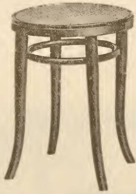
No. 900—S3. CANE SEAT No. 900—S4. VENEER SEAT HEIGHT 18 IN. SEAT 13¼ IN. DIAMETER