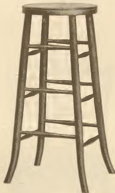
No. 999—S3. CANE SEAT No. 999—S4. VENEER SEAT HEIGHT 30 AND 32 IN. SEAT 13\frac{1}{4} IN. DIAMETER