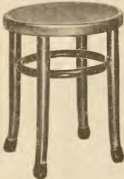
No. 909—S4 SEAT 13¼ IN. DIAMETER