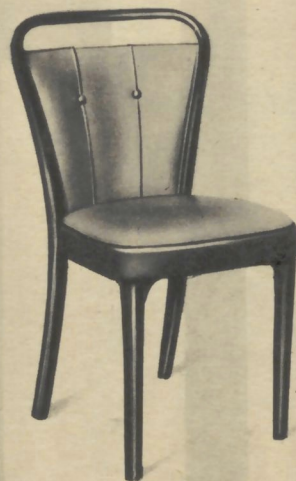
No. 37 □ garni