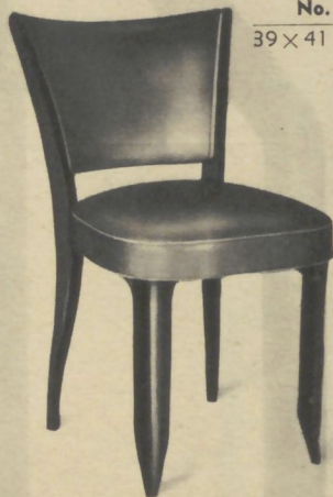
No. 571 □ garni