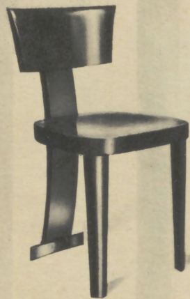
No. 548 39