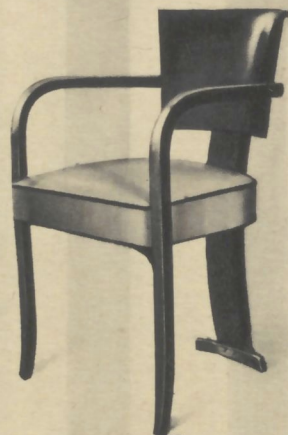
No. 395/F □ garni