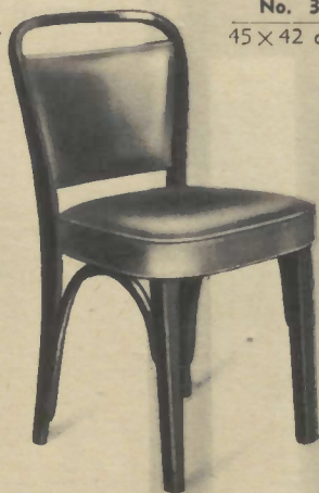
No. 35 □ ~ 21 garni