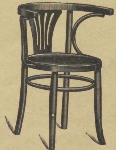
259 41 cm ○