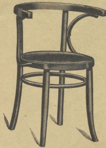
258 41 cm ○