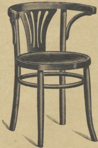
255 41 cm ○