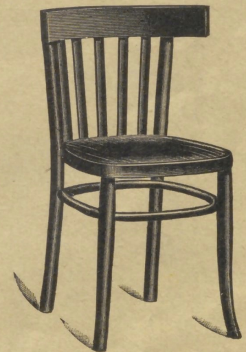
263 43×40 cm ○