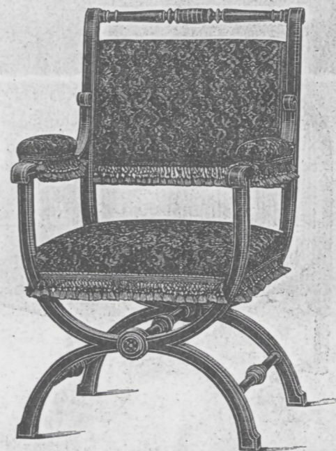
Salon-Garnitur Nr. 6 (pag. 56)