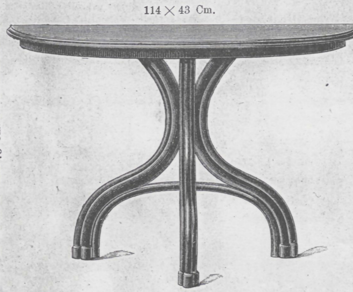
Nr. 8 fl. 17.—, Palisander oder Mahagony fl. 18.—