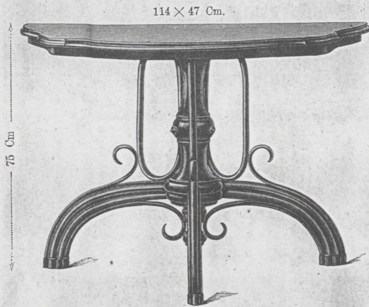
Nr. 6 fl. 31.—, Palisander oder Mahagony fl. 32.50