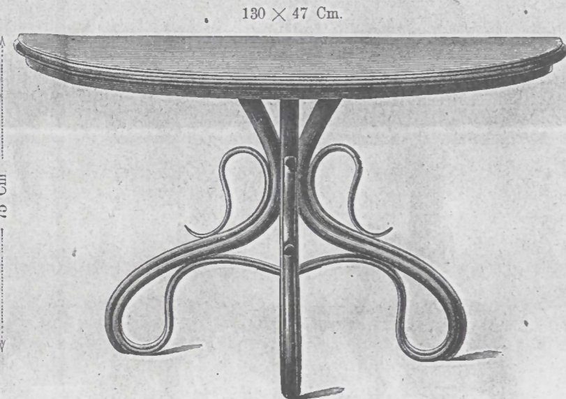
Nr. 3 fl. 21.50, Palisander oder Mahagony fl. 23.—