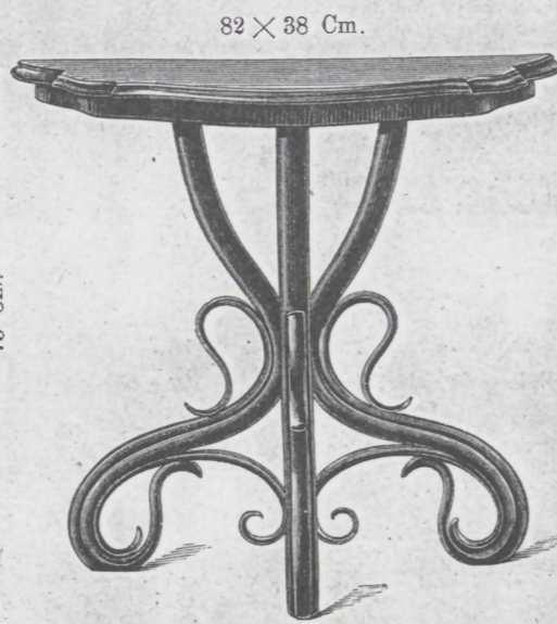
Nr. 1 fl. 19.—, Palisander oder Mahagony fl. 20.—