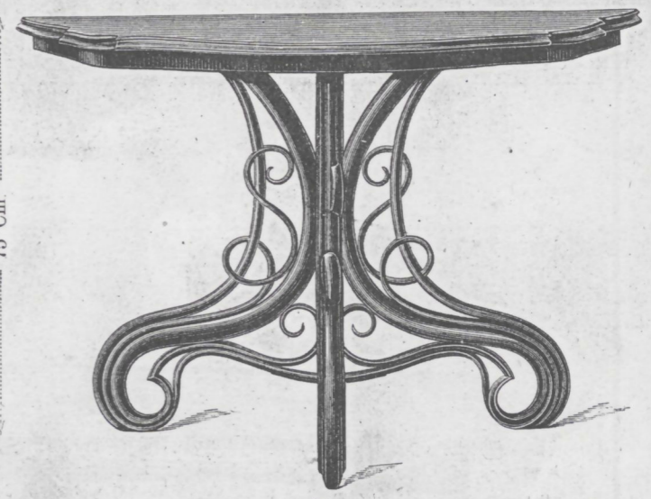
Nr. 27 geschweift, 130 x 47 Cm. . . . . fl. 28.50 gestreift, halboval, 114 x 47 Cm., . . . 28.30 Palisander oder Mahagony geschweift fl. 30.— gestreift fl. 29.80