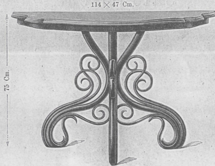
Nr. 4 fl. 26.—, Palisander oder Mahagony fl. 27.50