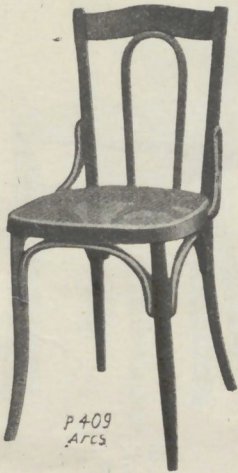
P 409 Arce