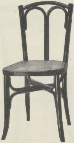
176 et 176 ½