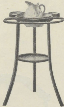
599 \frac{1}{2} non garni